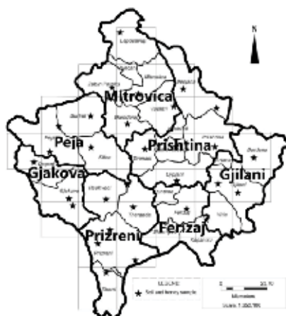
Fig. 1. Kosovo map with sampling sites

One cell represents around 363 km 2 and in each of cell was taken one sample for further analysis. Geographical sample locations were recorded by portable GPS during the sampling time, digital map with sampling location was prepared by MapInfo Professional software version 11.5. Honey samples were collected on 900 g glass jars.