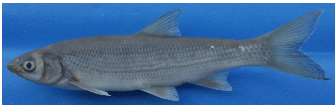
Figure 4. Chondrostoma colchicum , 160 mm SL; FFR 02010 Erzurum, İspir, Çoruh River.

Material Examined: FFR 01003, 30, 62-73 mm SL; Turkey: Artvin Province, Borçka County: Aralık Stream; 15 July 2011; -FFR 01012, 22, 90-