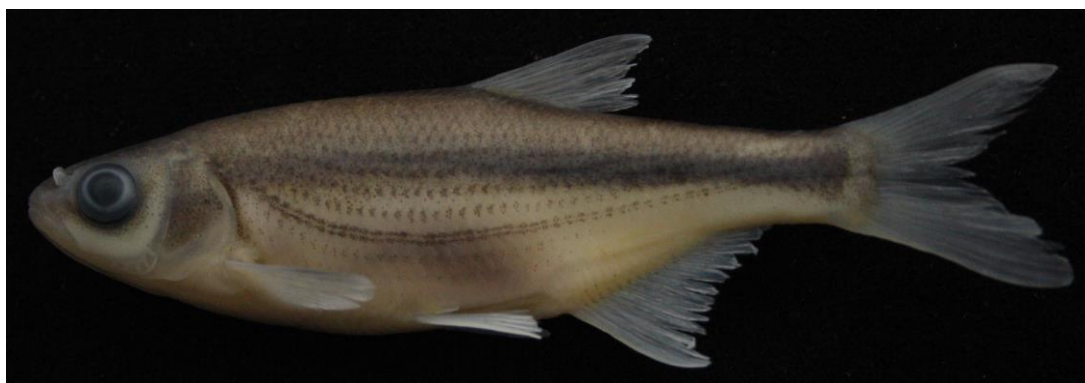
Figure 6. Alburnoides fasciatus , 75 mm SL; FFR 121003, Artvin, Borçka, Aralık Stream.