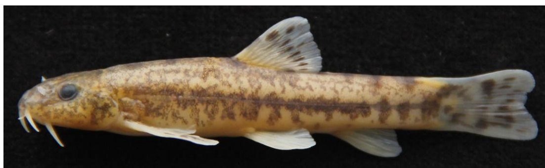
Figure 16. Oxynoemacheilus sp., 44 mm SL; FFR 01435, Erzurum, Oltu, Oltu Stream.