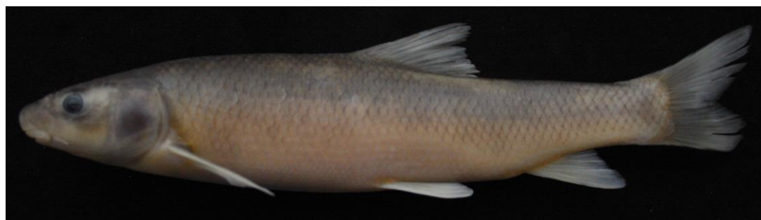
Figure 13. Capoeta sieboldii , 210 mm SL; FFR 01822, Artvin, Borçka, Çoruh River.