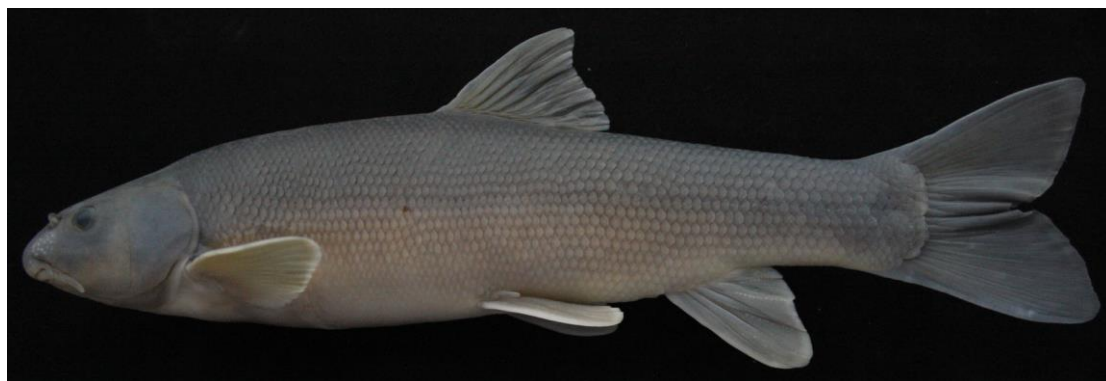
Figure 12. Capoeta banarescui , 231 mm SL; FFR 01833 Erzurum, İspir, Çoruh River.

Meristic characters: D: III-IV 8-9½, P: 15-19, V: I 9-10, A: III 5½, Lateral-line: 65-77, L. trans.: 12-14/8-10.