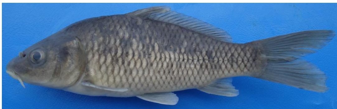
Figure 10. Cyprinus carpio , 134 mm SL; FFR 02640, Artvin, Borçka, Çoruh River.