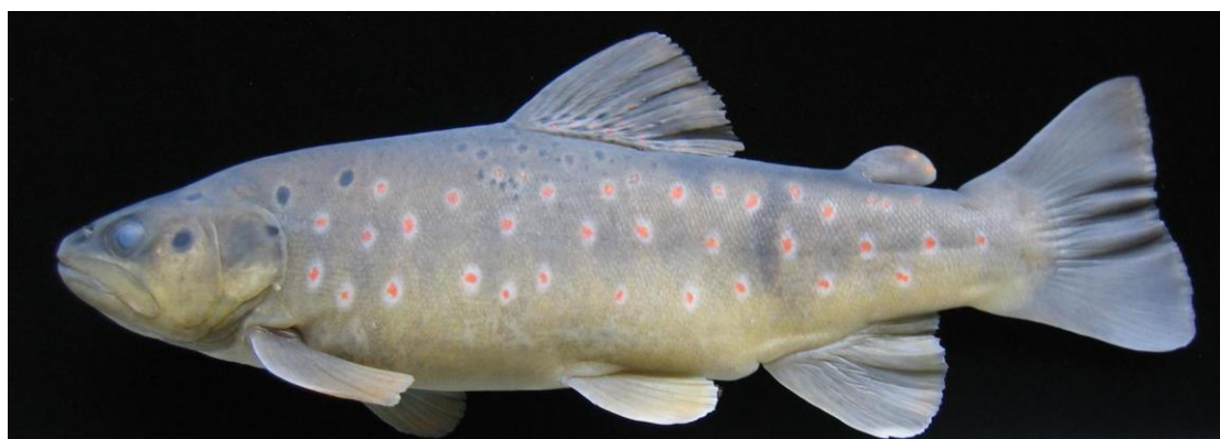
Figure 2. Salmo rizeensis , 200 mm SL; FFR 03017, Artvin, Yusufeli, Dörtkilise Stream.