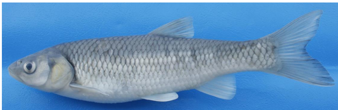
Figure 7. Squalius orientalis , 200 mm SL; FFR 00691 Erzurum, İspir, Çoruh River.

Meristic characters: D: III 7-8½, P: 13-16, V: 8, A: III 6½, Lateral-line: 39-41, L. trans.: 6/4-6.