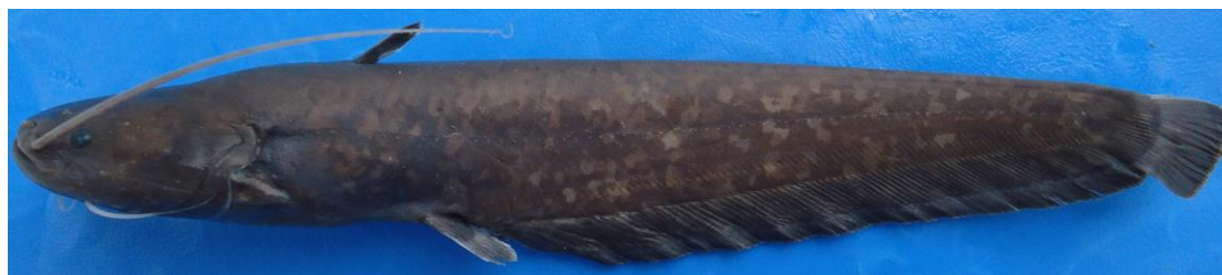
Figure 15. Silurus glanis , 500 mm SL; FFR 02600 Artvin, Borçka, Çoruh River.