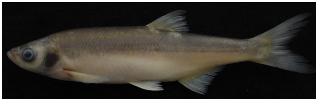
Figure 8. Alburnus derjugini , 161 mm SL; FFR 0935, Erzurum, İspir, Çoruh River.