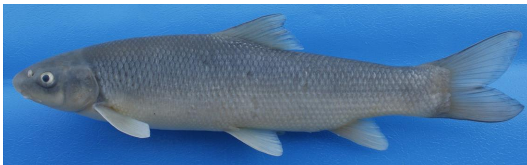
Figure 14. Capoeta ekmekciae , 210 mm SL; FFR 01621, Erzurum, İspir, Çoruh River.