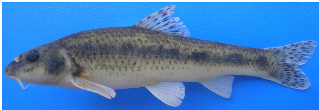
Figure 9. Gobio cf. caucasicus , 160 mm SL; FFR 01908, Artvin, Borçka, Çoruh River.

Distribution: Cyprinus carpio is known from Black, Caspian and Aral Sea basins. Introduced throughout the world (Kottelat and Freyhof, 2007).