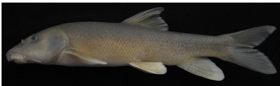
Figure 11. Barbus rionica , 220 mm SL; FFR 00232, Erzurum, İspir, Çoruh River.