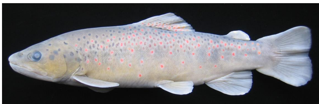
Figure 3. Salmo coruhensis , 300 mm SL; FFR 03025, Erzurum, İspir, Kırık Stream.

Meristic characters: D: III 9-10½, P: I 11-14, V: I 8, A: III-IV 8½, Lateral-line: 110-117, L. trans.: 25-28/18-21.