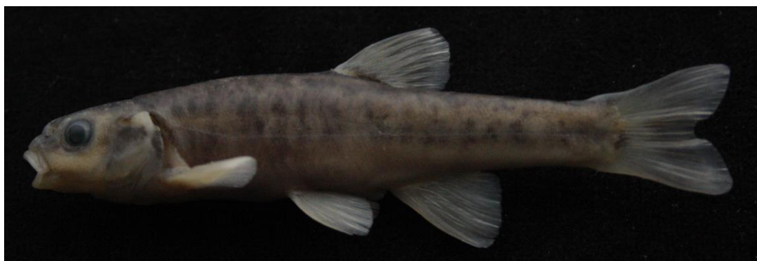
Figure 5. Phoxinus colchicus , 64 mm SL; FFR 02303 Artvin, Borçka, Çoruh River.