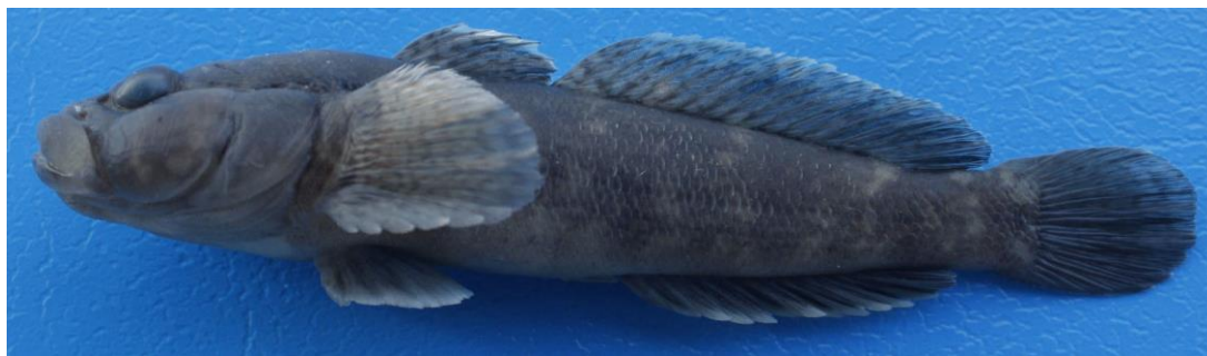
Figure 17. Ponticola constructor , 89 mm SL; FFR 02613, Artvin, Borçka, Aralık Stram

Material Examined: FFR 02600, 15, 166–300 mm SL; Turkey: Artvin Province, Borçka County: Borçka Dam Lake; 13 July 2010.