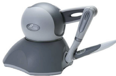
Figure 1. Haptic and haptic stick

The haptic used in this study has the interface related to gravitation, mass and weight concepts. In the used haptic environment there is three dimensional (x, y, z) haptic stick which enables the user to move objects in the real environment. The stick is pencil shaped and it can be easily moved according to the power direction given by user in the three dimensional environment Figure 1.