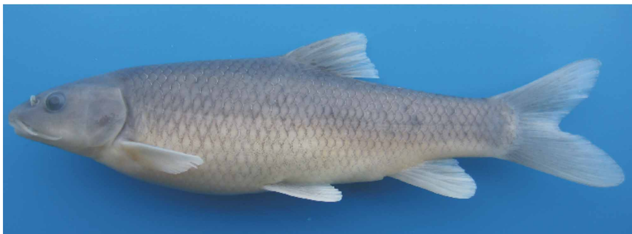
FIGURE 5. Luciobarbus kottelati , holotype, FFR 454, 155 mm SL; Turkey: Büyük Menderes drainage.

Dorsal fin with 4 simple and 8 branched rays, outer margin slightly concave, its origin markedly behind vertical through pelvic-fin origin, last simple ray thick and strongly ossified (Fig. 2a). Pectoral fin with 17–19 branched rays, outer margin convex. Pelvic fin with 1 simple and 8 branched rays, outer margin convex. Anal fin with 3 simple and 5 branched rays, outer margin convex. Caudal fin deeply forked, with lobes slightly rounded, lower lobe longer than upper lobe. Lateral line with 43–46 pored scales on body and anterior part of caudal; 7–8 scale rows between lateral line and dorsal-fin origin; 5–6 scales between lateral line and anal-fin origin. Gill rakers 4+9–11= 14–15 on outer side of first gill arch; 41–43 (modally 42) total vertebrae. Pharyngeal teeth 5.3.2–2.3.4, usually four on right and five on left in main row. Sexual dimorphism is present, male with tubercles on snout in spawning period.