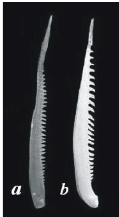
FIGURE 2. Last simple dorsal-fin ray of: a , Luciobarbus lydianus , FFR 454, 157 mm SL; b , L. kottelati , FFR 452, 142 mm SL.

Coloration. Both live and after fixation: dark brownish grey on back and flanks, yellowish white on belly. Dorsal and caudal fins greyish, pectoral, anal and pelvic fins yellowish. Flank scales with faintly marked and narrow black margin along posterior edge, not much contrasted against rest of scale; dark spot on scale pocket very contrasted. This feature is very marked on back and flanks, but less distinct on the scales close to belly and disappears totally after the line above pectoral and pelvic fins.