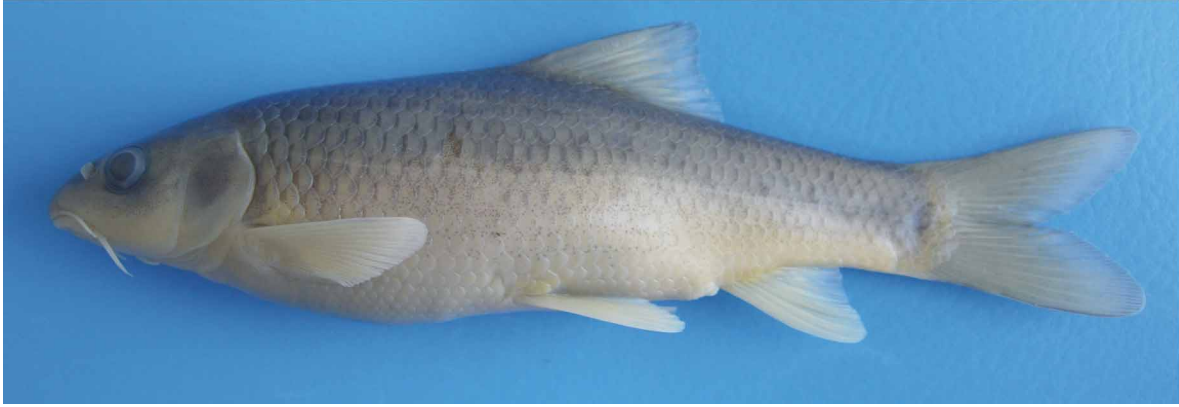
FIGURE 1. Luciobarbus lydianus ; FFR 452, 141 mm SL; Turkey: Gediz drainage.