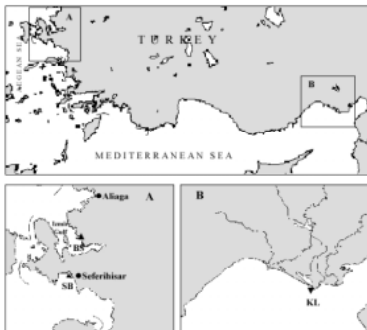
Fig. 1. Hatcheries and sampling regions. ● = hatcheries; ▲ = origins of Seferihisar broodstock: BS = Bostanli coast, SB = Sigacik Bay; ▼ origin of Aliaga broodstock: KL = Karatas lagoon.

RAPD-PCR. Forty 10-mer random oligonucleotide primers (OPA and OPB, each series consisting of 20 primers; Operon Technologies, Alameda, CA, USA) were used to amplify the genomic DNA. Amplification reactions were carried out on a final volume of 15 µl containing 25 ng DNA, 100 µM each of