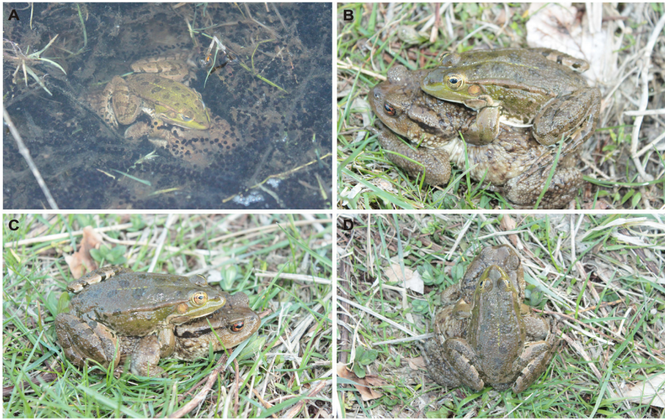
Figure 2 A) Amplexus of Pelophylax ridibundus ♂ with Bufo bufo ♀ in their natural habitat of Domaniç, Kütahya, B) Left lateral view, C) Right lateral view and D) Dorsal view. For photos B-D, the pair was gently moved to dry land by the investigator for closer inspection and subsequently placed back in the water.