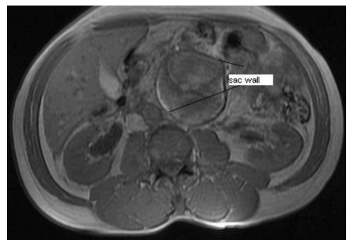
Figure 1. Aneurysmatic dilatation that is supposed to be an aortic aneurysm in MRI

and sapheneous vein grapht interposition had been applied to the patient. The patient discharged after the hospital stay without no complication.