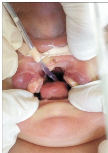
Figure 1. Pretreatment photograph.

An oral impression (Figure 2A) with type C silicon-based impression material (Zhermack zetaplus - putty and light body) was made in a clinical setting where an airway emergency could be handled. A stone cast was formed based on the impression (Figure 2B). A 0.8 mm stainless steel helix was attached to the posterior end of the appliance. Extra caution was exercised regarding the position and dimension of the helix so as not to disturb the infant's palate. After the undercuts on the stone cast were sealed with wax, an acrylic appliance was fabricated with the arms of the helix within the body of acrylic, using cold cured acrylic (imicryl-O 80 orthodontic acrylic). An acrylic button was formed on the anterior aspect of the appliance (Figure 2C). The planned