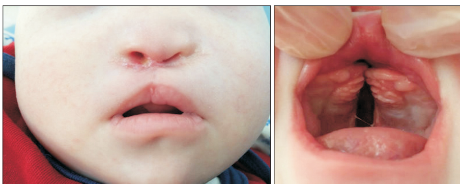
Figure 6. After lip surgery.