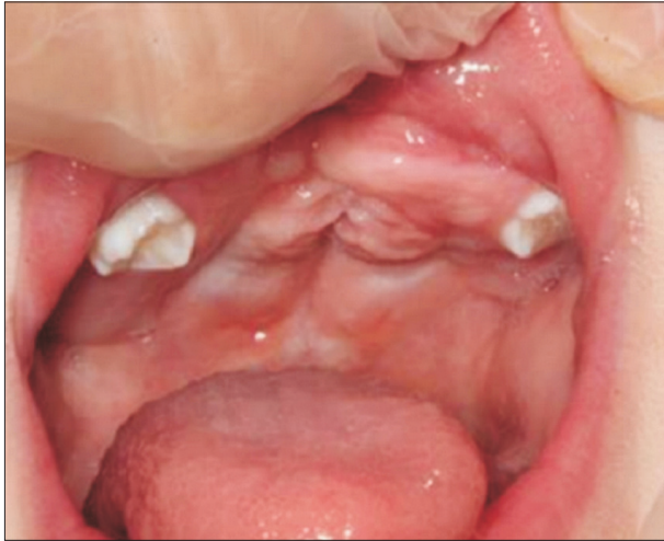
Figure 7. Twenty-one months after modified presurgical alveolar molding appliance therapy.