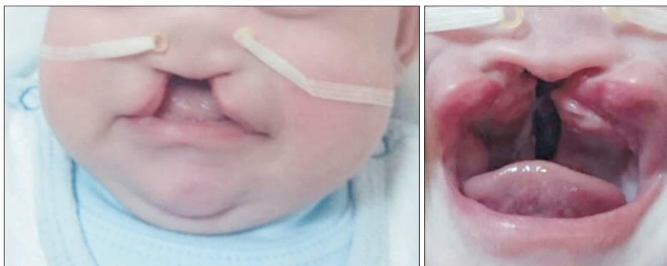
Figure 5. Two months after modified presurgical alveolar molding appliance therapy.

parent–specialist communication. Two months after the initiation of the treatment, the anterior cleft gap was reduced from 13 mm to 3 mm, as a result of successful compliance (Figure 5). The gap between the right and left segments of the palate was substantially closed. Another outcome of the modified PAM appliance use was provision of a separation between the oral and the nasal cavity that reduced food aspiration risk. After the cleft gap was reduced, we tried to reshape the nostrils with Grayson's PNAM technique used for bilateral cleft lip and palate in our patient. The nasal molding attempt failed due to a lack of compliance, and the nasal reshaping process was postponed until the surgical closure of the lip. The lip surgery was performed when the infant was 4 months (Figure 6). Nostril retainers (Koken) reshaped the nostrils following lip surgery, but unfortunately, parent cooperation could not be obtained on the second attempt too. The palate closure surgery was performed when the infant was 9 months. The infant successfully passed the hearing test performed after the palate surgery. With resultant stability of the changes seen after a follow-up period of 21 months demonstrated that oral reshaping with the modified PAM appliance was successful (Figure 7).