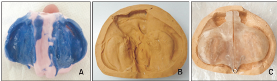
Figure 2. A, Polyvinyl siloxane impression of the infant's maxilla. B, Stone cast. C, Modified presurgical alveolar molding appliance.