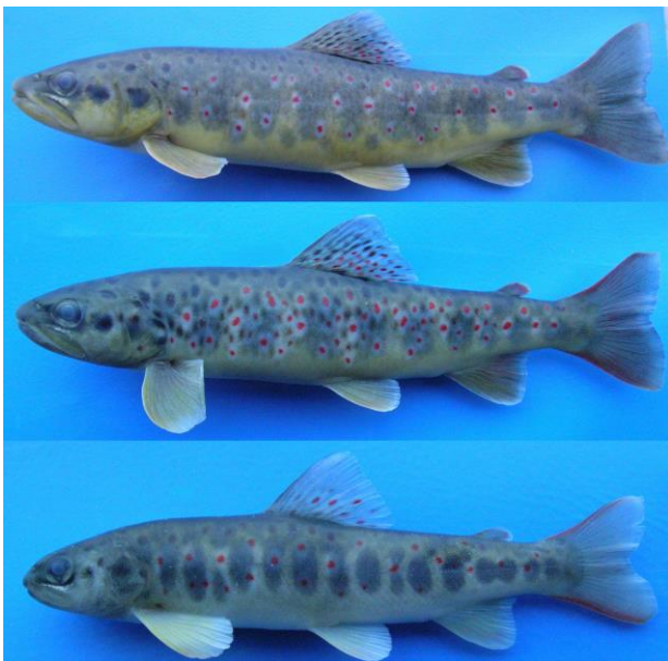
Figure 1. Salmo duhani , from top: FFR 3183, holotype, 228 mm SL, male; FFR 03184, paratypes, 160 mm SL, female, and 92 mm SL, juvenile; Turkey: stream Zeytinli.

Salmo duhani , new species (Figure 1): Salmo trutta macrostigma (non Duméril, 1858): Sarı et al., 2006: 37 (Çanakkale province; Yenice county; Stream Çelebi, a drainage of Gönen River).