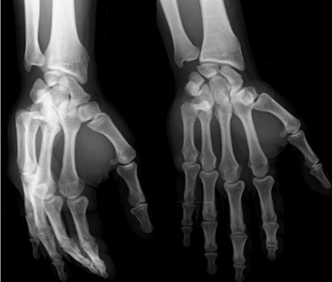
Figure 1: X-ray views (anteroposterior and oblique). The anteroposterior view shows overlapping of bones at two ulnar-sided carpometacarpal joints, loss of joint space, and in parallelism of joint lines. The dorsal dislocations are best visualised on oblique view.