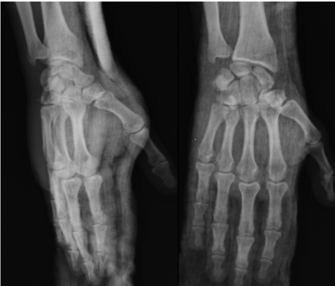
Figure 2: After reduction and cast splinting, control anteroposterior and oblique views.