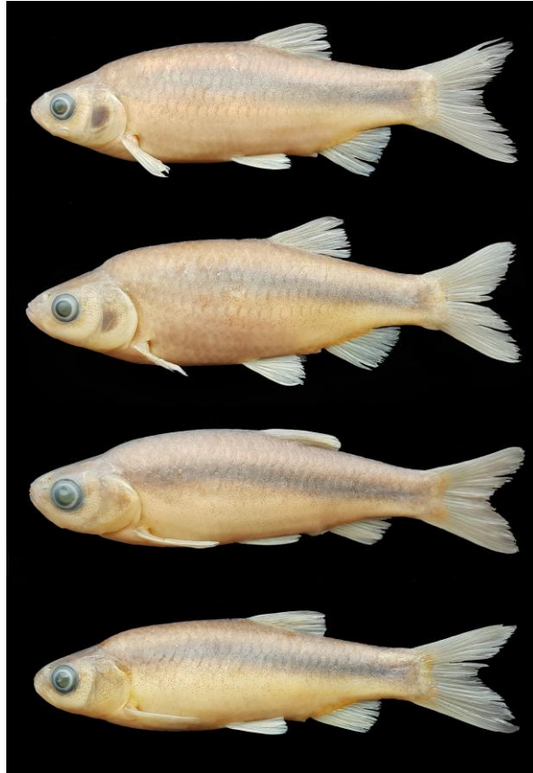
Figure 3. Petroleuciscus ninae , from the top: FFR 3845, 82 mm SL; 78 mm SL; Türkiye: stream Sarıçay; FFR 3854, 74 mm SL; 71 mm SL; Türkiye: Lake Acıgöl.