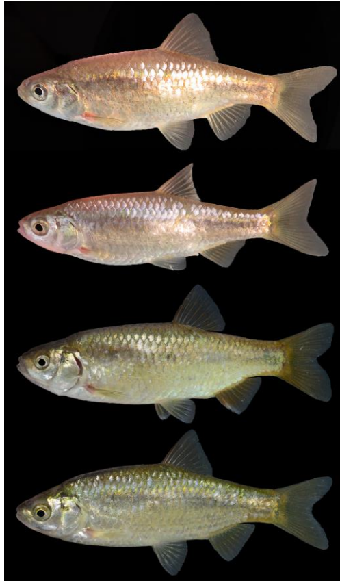
Figure 5. Petroleuciscus ninae , from the top: FFR 3860, 71 mm SL; 64 mm SL; inflow of Yenişehir Pond, Küçük Menderes Drainage; FFR 3861, 50 mm SL; a north-eastern drainage of Tahtalı Reservoir; FFR 3853 72 mm SL; Yenicekent DSİ poms, Büyük Menderes River; not preserved, about 60 mm SL, Stream Akçay Büyük Menderes drainage.