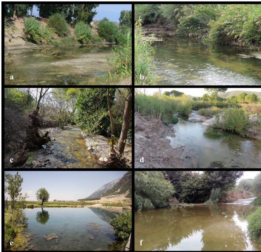
Figure 2. Habitat of Petroleuciscus ninae : a, Stream Akçay; b, Yenicekent DSİ pom station, Büyük Menderes River; c, inflow of Yenişehir Pond, Küçük Menderes Drainage; d, Stream Balaban, Tahtalı Reservoir Drainage; e, Spring Gemiş, Lake Acı Basin; f, Sarıçay River.

The zoogeographic distribution of Petroleuciscus ninae and P. smyrnaeus in the Turkish Aegean Sea drainages, with P. smyrnaeus inhabiting between the rivers Bakırçay and Gediz (around İzmir), and P. ninae inhabiting Tahtalı Reservoir basin to the north and Sarıçay River to the south, nested within the range of the Capoeta and Chondrostoma species in the same region. Capoeta aydinensis and Chondrostoma turnai distributed in Büyük Menderes River and southern