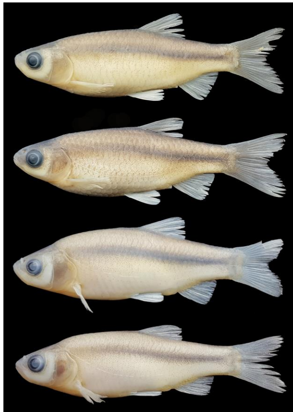
Figure 4. Petroleuciscus ninae , from the top: FFR 3860, 71 mm SL; 66 mm SL; Türkiye: inflow of Yenişehir pond, Küçük Menderes drainage; FFR 3861, 50 mm SL; 40 mm SL; Türkiye: a northeastern drainage of Tahtalı Reservoir.