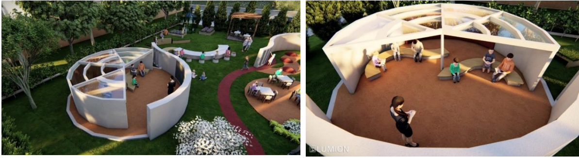
Figure 2. The designed outdoor classroom

provided, allowing students to store their materials. In addition, together with individual games, playgrounds that enable group work are designed.