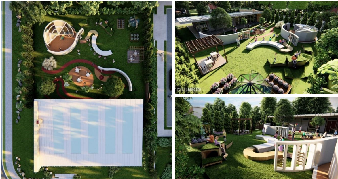
Figure 1. Schoolyard design

Considering the opinions of both teachers and designers on the characteristics that an ideal outdoor classroom should have and the information obtained from the literature, sample design models have been tried to be developed within the scope of the study on outdoor classrooms.