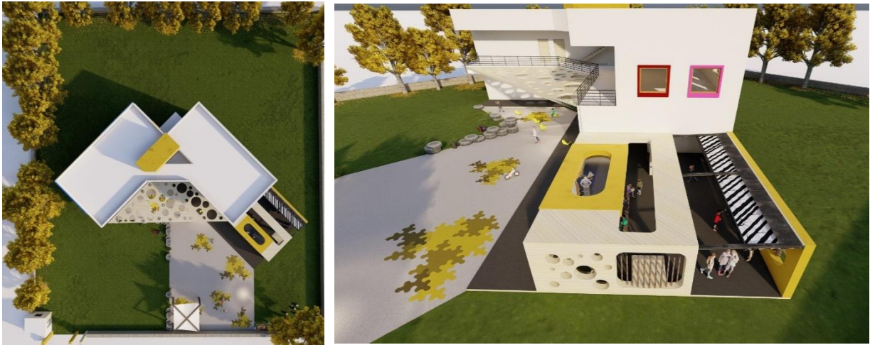
Figure 4. Modelling of the outdoor classroom associated with the school building

In the designed open classroom, a layout was created with intelligent boards, seating units fixed to the floor and equipment that can be converted according to needs (Figure 5). The equipment placed in the classroom has been designed with a transformable feature consisting of unstructured, detachable modular blocks that improve the child's creativity. The setting unit transforms into a conversation area that is accessed by steps. A fun abacus area has been placed across the classroom for instructors and students.