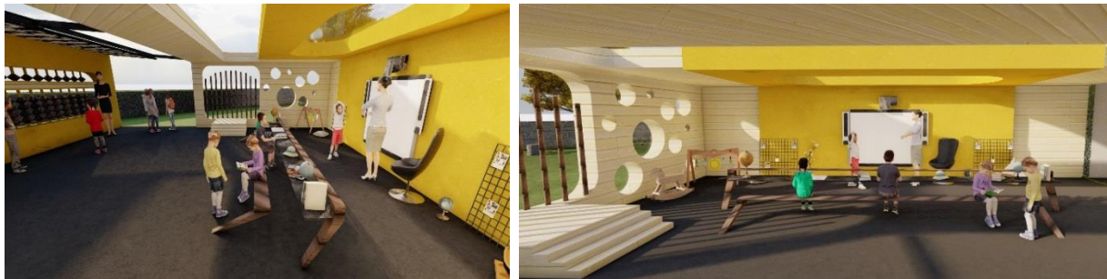
Figure 5. Outdoor classroom interior image

In the designed open classroom, a layout was created with intelligent boards, seating units fixed to the floor and equipment that can be converted according to needs (Figure 5). The equipment placed in the classroom has been designed with a transformable feature consisting of unstructured, detachable modular blocks that improve the child's creativity. The setting unit transforms into a conversation area that is accessed by steps. A fun abacus area has been placed across the classroom for instructors and students.