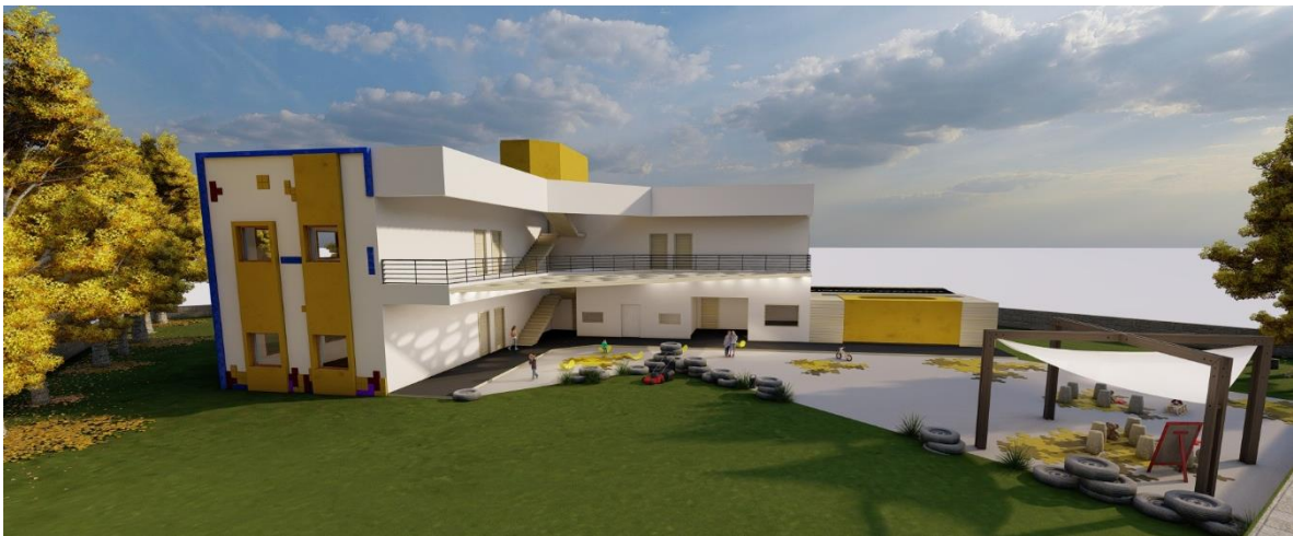
Figure 3. Second model school garden image

The second model study connects the green area with transitions in the school garden on the hard ground. A shaded area was created for the children with the wooden structured cover element placed in the garden area and the sitting logs designed from the same material (Figure 3).